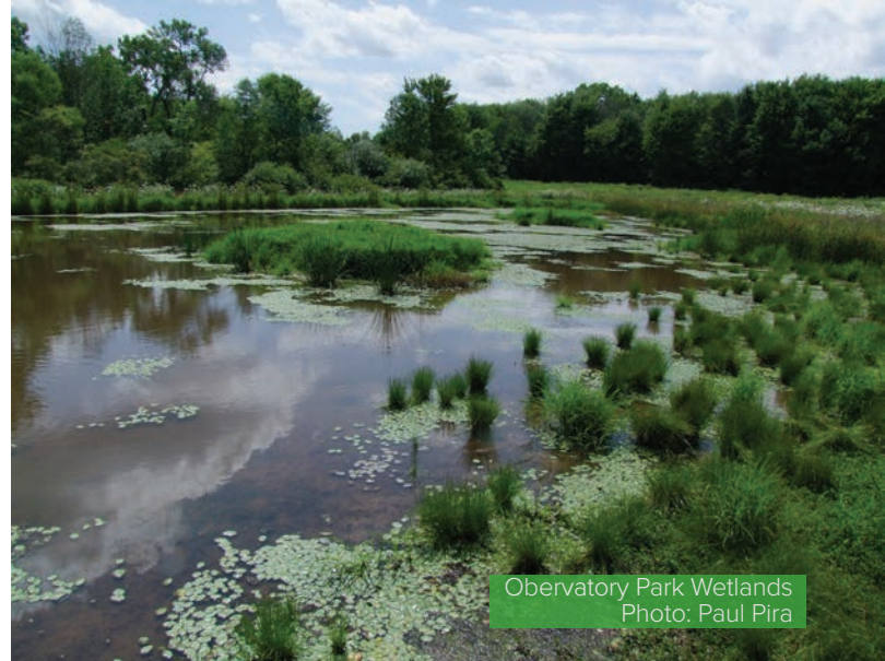
Observatory Park Wetlands

The scope of work conducted by Geauga Park District's Natural Resources staff included managing undesirable invasive plant species like Canada thistle, common teasel, multiflora rose and buckthorn in both parks by utilizing best practices of physical removal, chemical control and prescribed burns. Conversely, to continue to propagate desirable meadow plant species, staff and volunteers collected native seeds from both properties to be used in future meadow restoration projects and to contribute to a multistate pollinator initiative entitled Project Wingspan, which is part of The Pollinator Partnership.